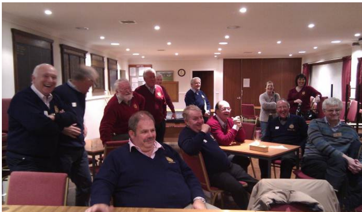
Perth and Kinnoull Club Members enjoy the first gavel of the season