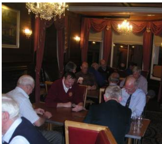
Auchterarder and Kinnoull fill the house for the gavel competition in a very relaxed evening

I thought that this was the end of the shocks but, no; no such luck. A lot of the time I spent was stood watching other players; time I thought was for recovery. Recovery? Don't make me laugh! This time has to be spent moving sideward along the length of the ice while bent over a brush. If I had trouble