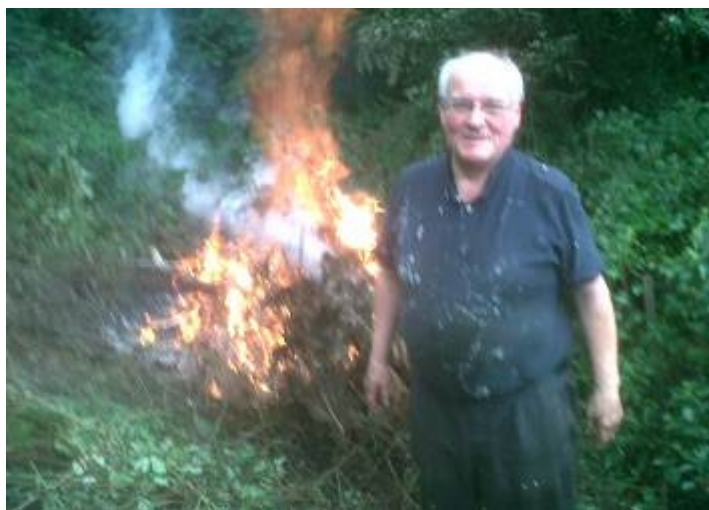
Enthusiastic acceptance for JVP's suggestion to the archive storage problem