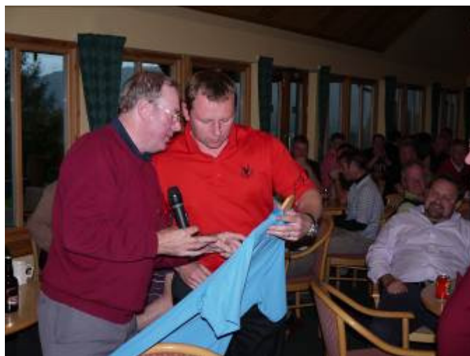
See, there are two Is in Kinnoull

So why did I go back for a second beginners' session? Well, you can work that out for yourself. Respect to penguins.